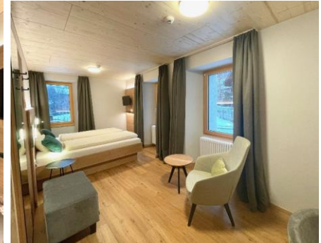
Find out more