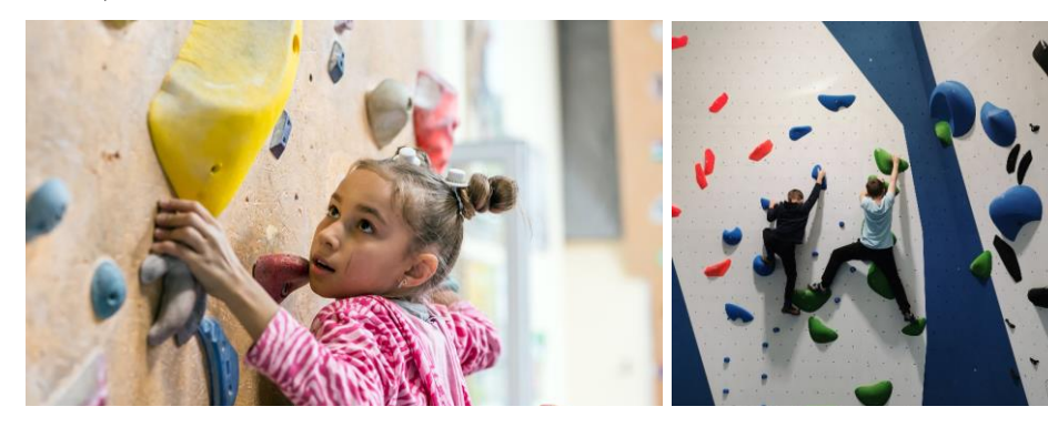
Find out more

The Sport Resort Fiesch opens their new bouldering hall on 3 February 2024. The 230m<sup>2</sup> hall offers guests a unique experience, whatever their level of experience in climbing and bouldering. This will benefit guests of the Sport Resort Fiesch, but also the local population and guests of the Aletsch Arena, Bellwald Tourism and Goms Tourism. The hall may be used during official opening hours by everyone from the age of 10 (children up to 16 years must be accompanied by an adult).